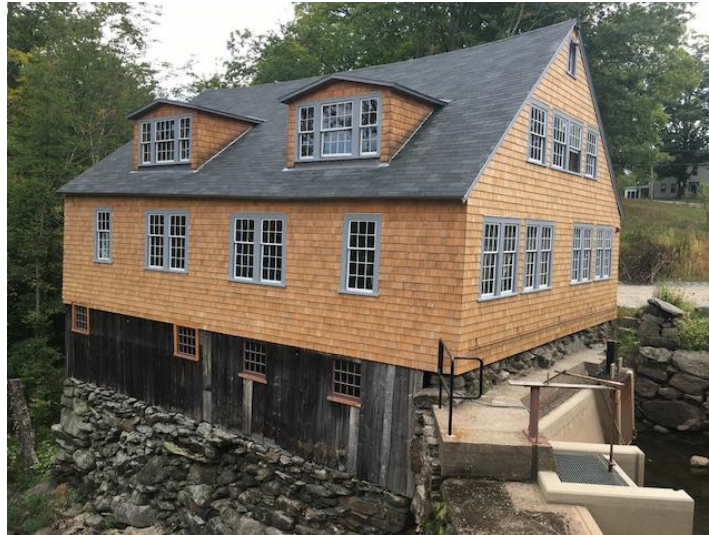
Completed exterior of Chase's Mill, from the northwest

“Energy and persistence conquer all things.” — Benjamin Franklin